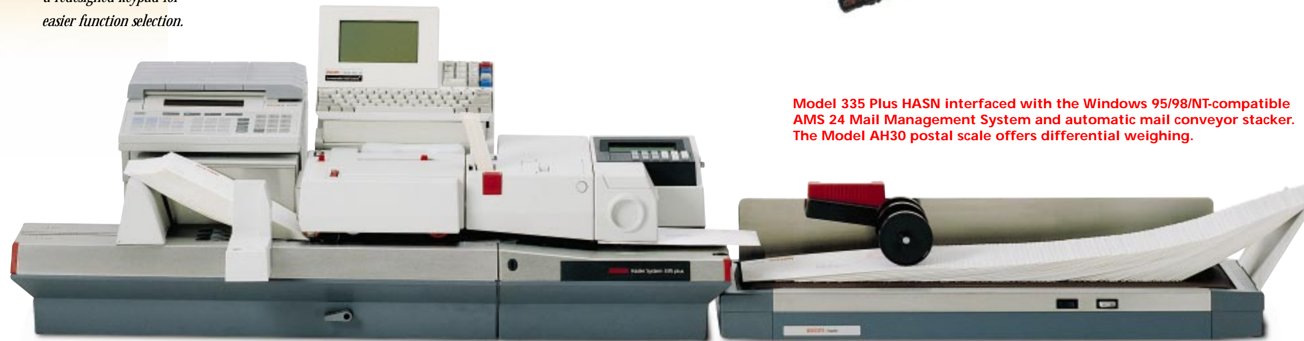
Model 335 Plus HASN interfaced with the Windows 95/98/NT-compatible AMS 24 Mail Management System and automatic mail conveyor stacker. The Model AH30 postal scale offers differential weighing.