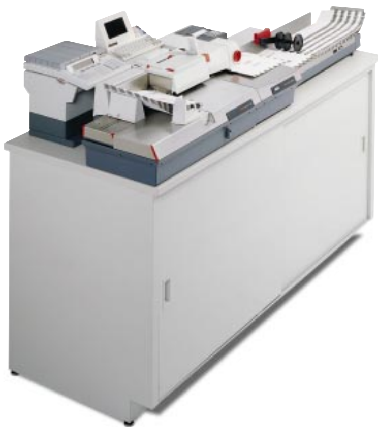
Ascom Model 350 Plus HASN interfaced with Model AH30 postal scale and an AMS 24 (MMS) data collection and management system. Displayed on a custom-built operating console.