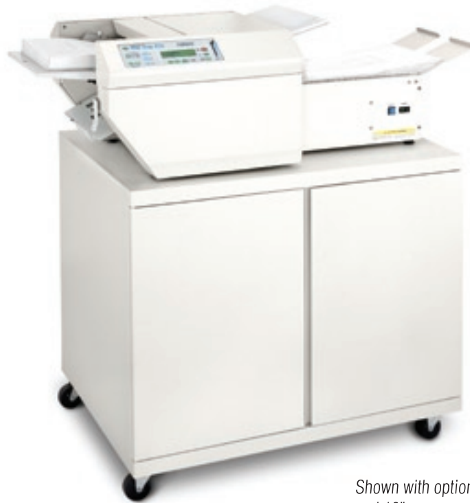
Shown with optional Cabinet and 18" conveyor

The AutoSeal ® FD 2052 is a fully automatic folder/sealer providing the ultimate solution for processing pressure sensitive self-mailers. Designed with ease of operation and efficiency in mind, the FD 2052 automatically detects and adjusts for 11" and 14" (Int'l Size A4) paper sizes and is pre-programmed for three popular folds "Z", "C" and half. The FD 2052 also has the ability to store up to 9 custom fold settings with the simple touch of a button. Up to 350 forms can be loaded in the hopper and processed at speeds up to 11,000 per hour. These features combined make the FD 2052 an ideal solution for streamlining your post processing. The FD 2052 also comes with an optional fully enclosed cabinet for storage and an 18" (46cm) or 4' (122cm) high capacity conveyor with a photo eye for neat and sequential stacking of processed forms.